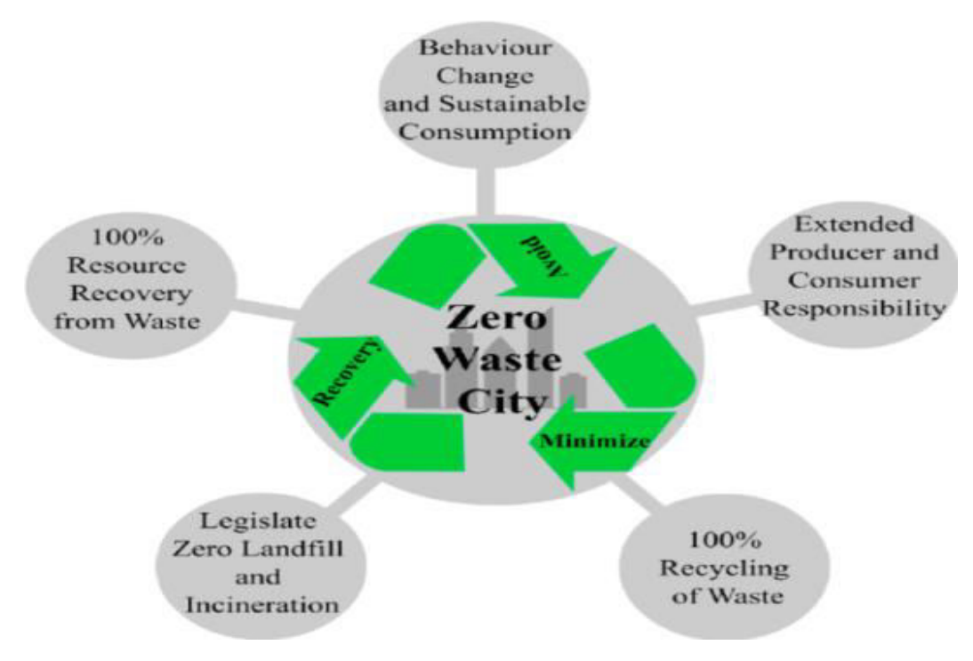
Figure 1: Source of MSW Generation

Thus, solid becomes waste when it becomes useless and harmful. The problem can be reduced and zero wastes concept can be achieved by reducing its amount, recovery of waste and making it harm free and useful. [5]