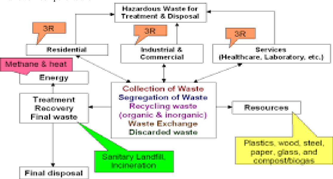
Figure 2: Age Based ISWM (UNEP, 2009)

It is exceptionally helpful to plan of new frameworks and determination of newadvancements. It talks about squander counteraction and decrease, reusing, partition at source frameworks and particular assortment, choice of new advances. The idea of ISWM in light of its age from various sources including homegrown, business, modern and farming. This waste could be further delegated risky and non-dangerous wast (Figure 2). The previous must be isolated at source furthermore, treated for removal as per the sever guidelines. 3R methodology (lessen, reuse and reuse) in material both at source as well as at the unique levels of strong waste administration chain including assortment, transportation, treatment and removal (UNEP, 2009).