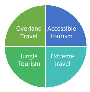
Figure 3: Categorization of Adventure Tourism on the basis of Categorization of Interest of Tourist[6].

In Rajasthan, Thar is famous for camel riding, and Thar Mahotsav attract many tourists from the corner of the world. After Rajasthan, many other states have started the camel safari to attract more and more tourist. Bikaner, Jodhpur and Jaisalmer are the famous destination for camel safari in Rajasthan. The one adventure sport activity has been getting attraction i.e., paragliding. Rock climbing sport is touching new heights as this sport is very new but because of availability of many locations. The famous location for rock climbing is Badami, Kanheri, kabbal and Manori. The skiing is also getting famous among tourist and famous place are Shimla, Manali, Mussoorie and Nainital. There are large number of hill station in India and some of the hill stations are having international fame. Some of the most crowded and lovable hill station are listed as in Table 1[8].