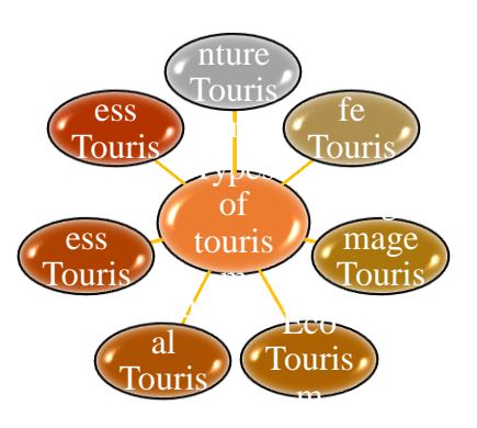
Figure 2: Types of Tourism Available in India as per Categories by Tourism Department[2].

movement or travel of a person or group of people from one destination to another one in order to explore or spend some time over there. The purpose of the tourism is to mutual understanding of the culture, food and customs of another place apart from appreciation of beauty of that place. There are many places in the world that are famous tourist place just to spend time over there and enjoyed beauty of that place, despite this, some places are having historic importance and people visit there for educational purpose and just to know the fact related to that place. Basically, tourism is sort time movement from the place where one is usually live and work. During the stay outside of place of work and residence, one is spending money on many things like food, stay, transport etc. and these expenses will create a livelihood for the local people (Figure 2)[2]–[5].