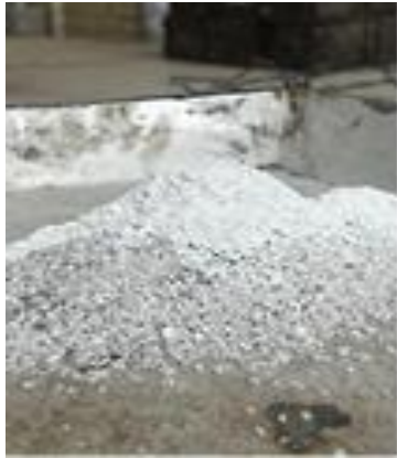
Figure 1: Waste Marble Powder (WMP)

this research endeavor is to manufacture innovative, sustainable and eco-friendly concrete by partially replacing sand with waste marble powder at different percentages by weight of sand in concrete.