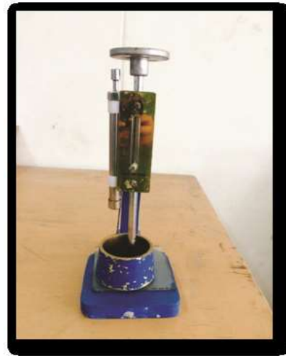
Figure 4: Vicat's Apparatus