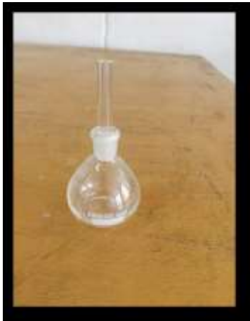
Figure 3: Specific Gravity Bottle

Therefore, specific gravity of cement = 3.15