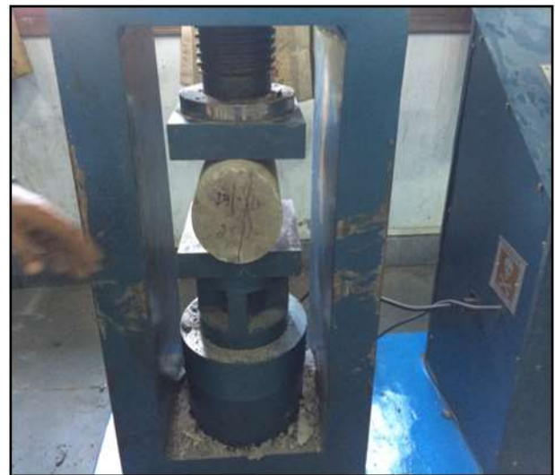
Figure 6: Compression Testing Machine

d = Diameter of cylindrical specimen in mm