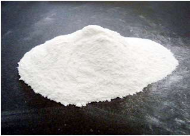
Figure 2: Marble dust

In literature, waste marble dust (WMD) is replaced with fine aggregates passing through 1mm sieve. Till now there is no single study of the concrete prepared by WMD. Various studies related to the utilization of marble dust as a fine sand aggregate into the normal strength concrete have not reached a convincing conclusion. Investigations and studies related to WMD are necessary to evaluate the usages of this waste material. Current study is beneficial to evaluate and mitigate the environmental related issues.