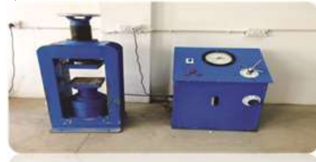
Figure 5: Compressive Testing Machine

determine the compressive strength of specimen. (as shown in figure 5)