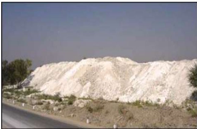
Figure 1: Dumping of Marble dust

The marble cutting plants are dumping the powder in any nearby pit or vacant spaces, near their unit although notified areas have been marked for dumping. It causes serious environmental problems, pollution and occupied vast area of land after the powder dries up. (as shown in the figure 1)