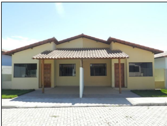
Figure 2. Residence object of study

The city of Porto Real is located in the southeast region of the State of Rio de Janeiro, at 385m altitude, with an area of 50.7km 2 . Its geographical coordinates have the following data: Latitude: 22° 25 '11 "S, Longitude: 44° 17' 25" W [14] Figure 2 shows a photo of the residence, used as object of this study.