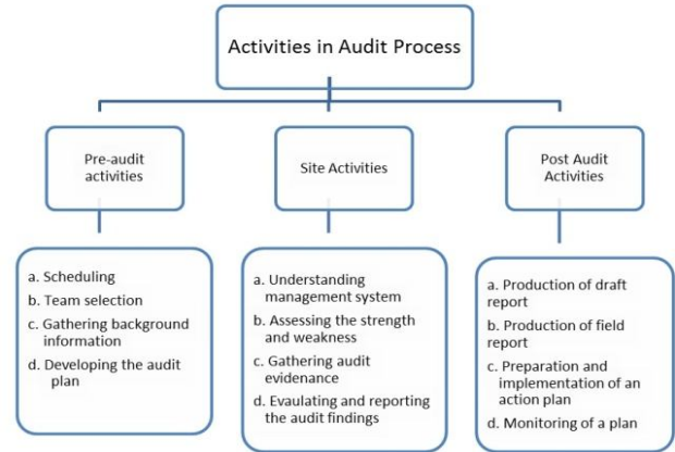
Figure 3. Activities in Audit Process

Audit practices can be differentiate based on the level of auditing, but the activities and guidelines are same at any level. Audit team should plan properly before reaching to the site. Audit team should collect the maximum fruitful information form the site. At last after auditing team have to compile the final report. Activities in auditing process are shown in figure 3.