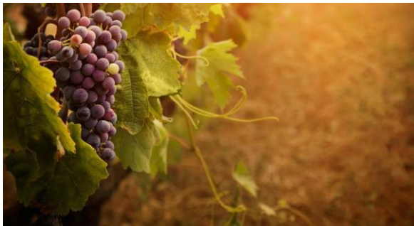
Fig. 2: Colored Image

Image processing is used for manipulation of digital images through a computer. It is a field of signals but focus mainly on images. It focuses on developing a computer system for processing an image. The input of that system is a digital image and the system then process that image and gives an image as an output. For Example we take this colored image as an input. And gives this black and white image with just some simple lines of code-