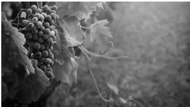
Fig. 3: Black and White